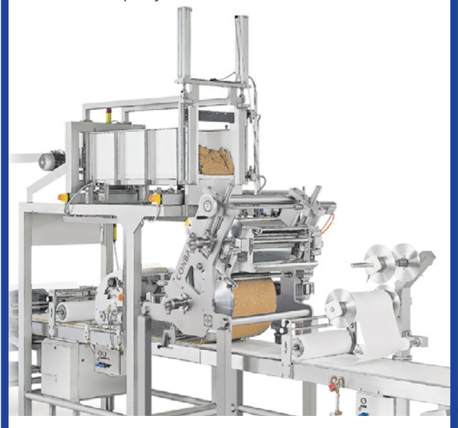
Figure: Conb S14 Line (Used with permission)